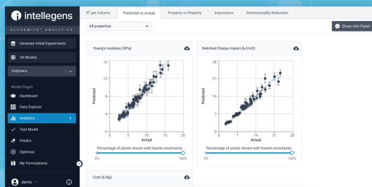
Analysing property data in the Alchemite™ Analytics user interface

Extract value from sparse, noisy experimental and process data